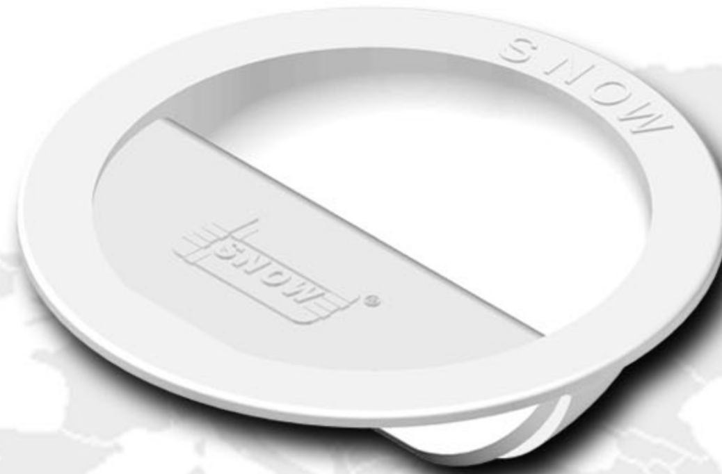
AMD98(28) Anti-Mosquito Device (28mm Height) * For Mini Floor Trap