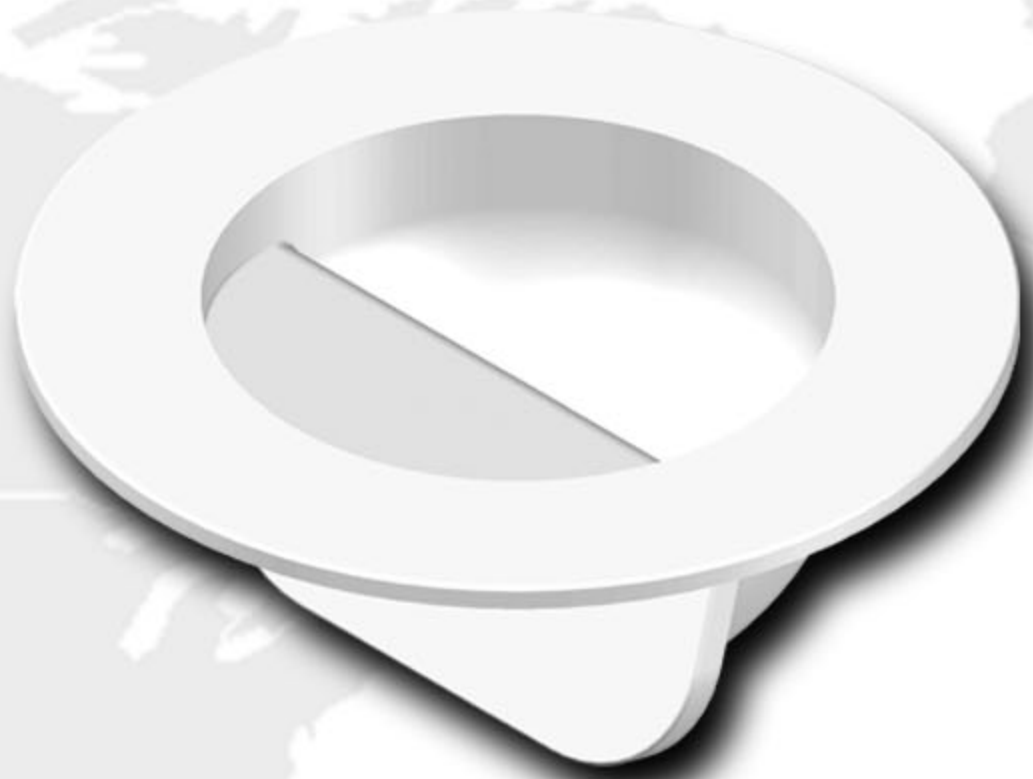
AMD98(66) Anti-Mosquito Device (66mm Bottom ) * For New Floor Trap Grating Adaptor