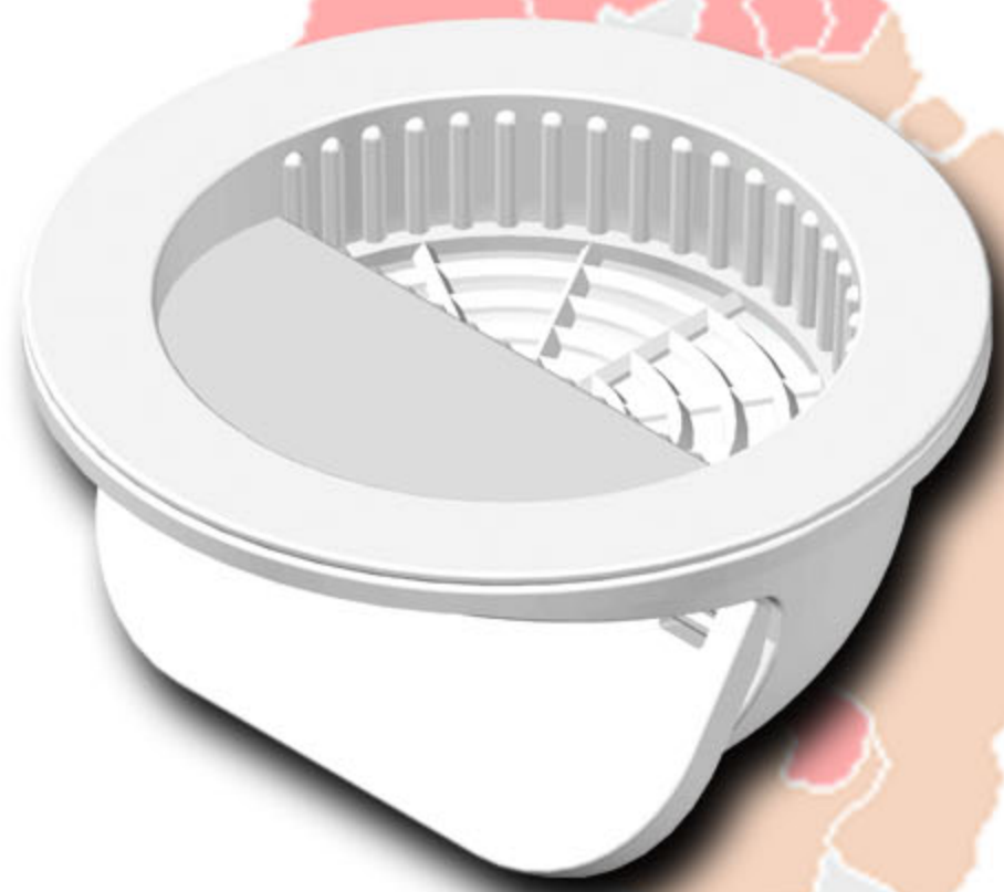
AMD78 Anti-Mosquito Device 78mm * For 3" Floor Grating