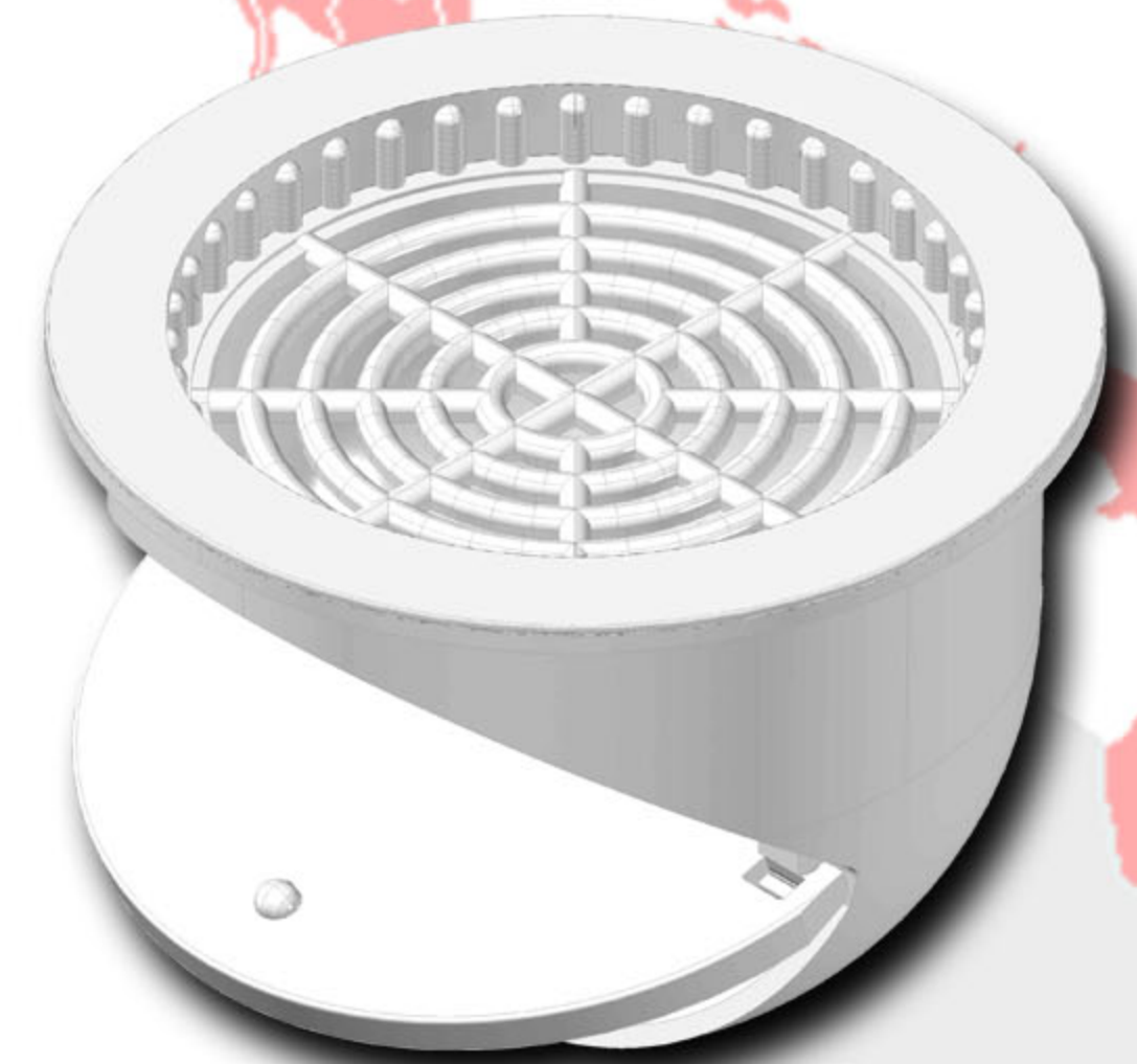
AMD98 Anti-Mosquito Device 98mm * For Drainage, Balcony & Corridor