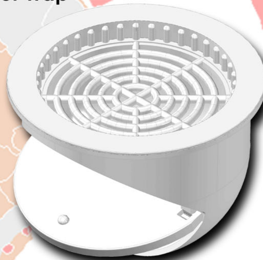
AMD98S Anti-Mosquito Device (Short) * For Bathroom