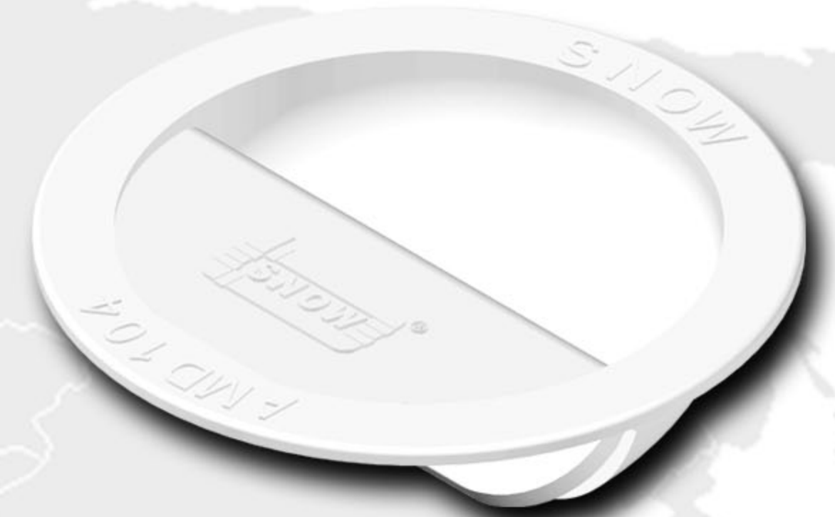
AMD104 Anti-Mosquito Device 104mm * For Mini Floor Trap