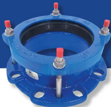
Universal Flange Adaptor