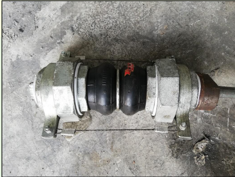
Figure 1: Photograph of 2" Union Flexible Joint.

This Test Report refers only to samples submitted by the applicant to SIRIM QAS International Sdn. Bhd. and tested by SIRIM QAS International Sdn. Bhd. This Test Report shall not be reproduced, except in full and shall not be used for any purpose by any means or forms (including but not limited to advertising purposes) without written approval from the Chief Executive Officer, SIRIM QAS International Sdn. Bhd. Please refer the last page for Conditions Relating to the Use of Test Report.