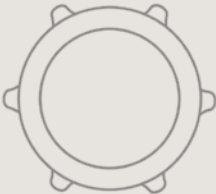
Conex Compression ribnut profile